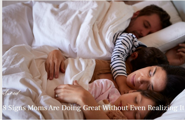
8 Signs Moms Are Doing Great Without Even Realizing It

All Pro Dad and iMom are websites that provide a plethora of resources and support to parents across the nation. Each site boasts invaluable tools to for parents to connect with their kids in fun, kind, and creative ways. All Pro Dad also features information for local chapters where fathers can come together with other dads in their community to support and celebrate each other. iMom has free, incredibly helpful, printables for download that include: lunchbox notes, activities, behavior charts, etc.