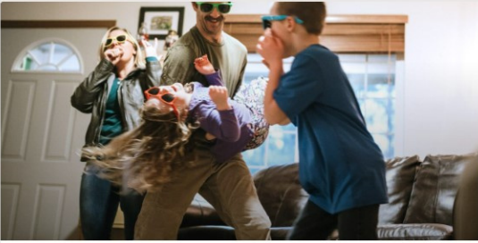
5 Out-of-the-Box Ways to Connect as a Family